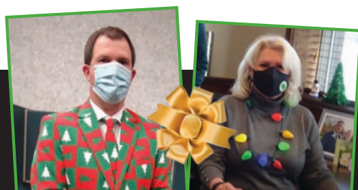
Holiday Traditions (PAGES 4 – 5)