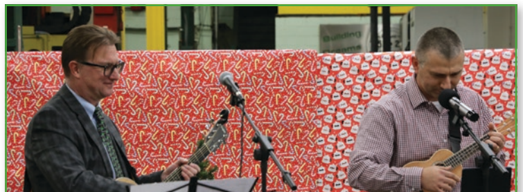
We were treated to a special performance by Chris Duffy and Darius Basznianin.