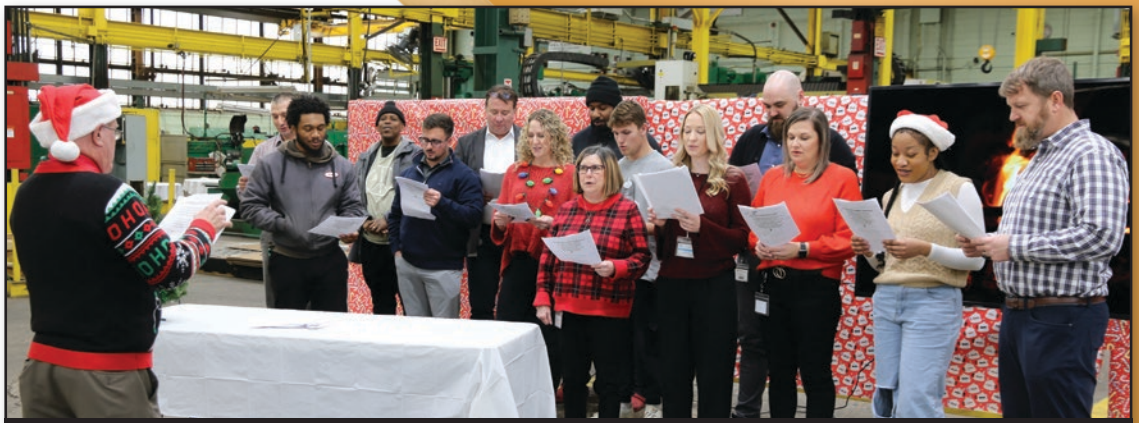
THE SANDMEYER STEEL COMPANY CHOIR

The Sandmeyer Steel Company Players presented “Ronnie Wonka and the Sweet Sandmeyer Chocolate Factory.”