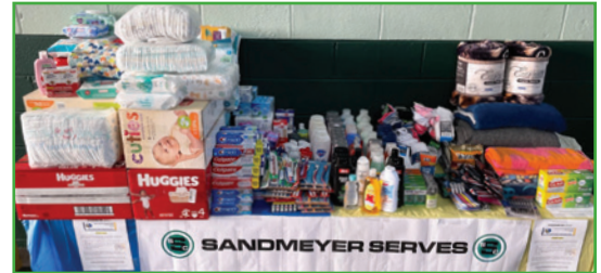
* Donations collected for Ukraine.