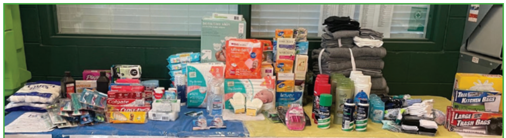
* Donations collected for Ukraine.