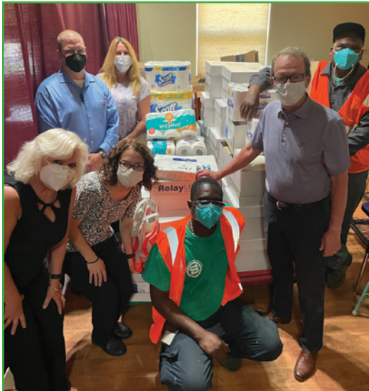
* Donations collected for Feast of Justice.