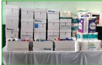
* Donations collected for Feast of Justice.