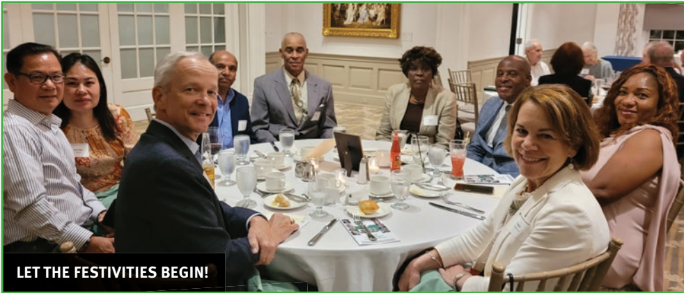
LET THE FESTIVITIES BEGIN!