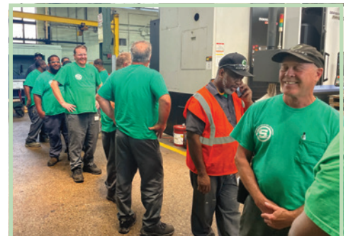
Chipotle buffet brings a long line of hungry employees!