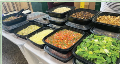
The 4th of July spread from Chipotle.