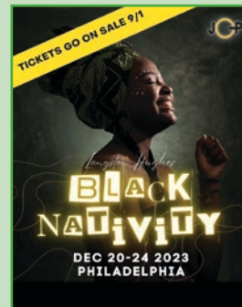
The poster for Black Nativity